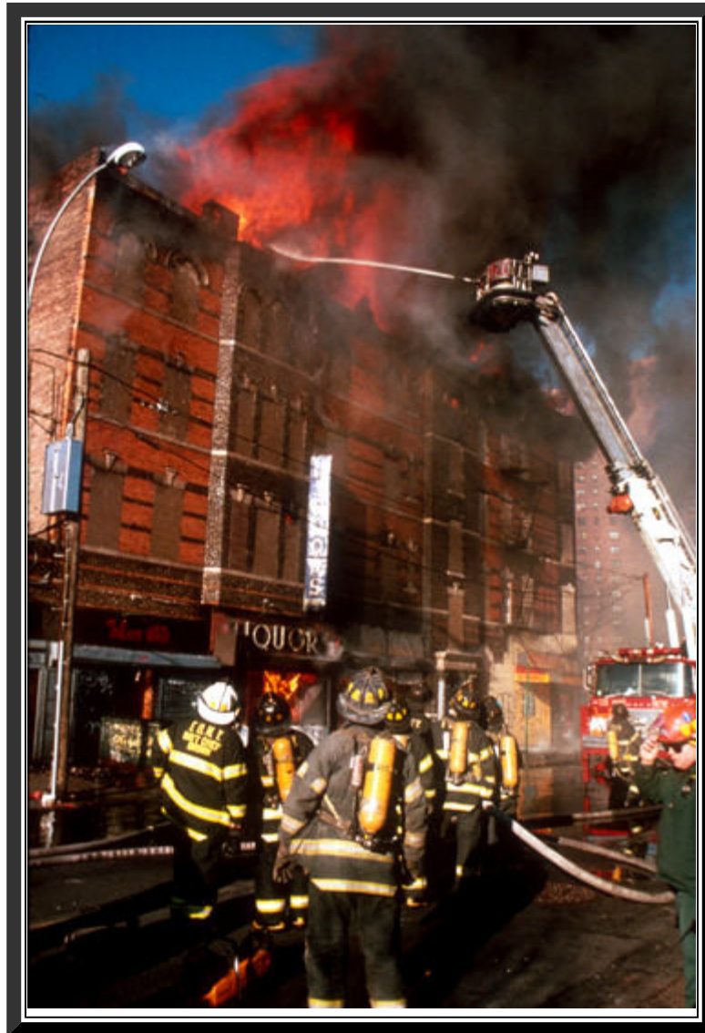
Ordinary type III Construction